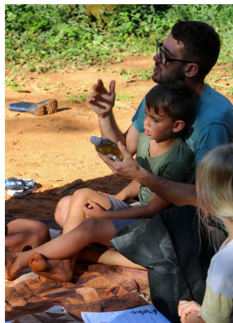
Phases of nature connectedness